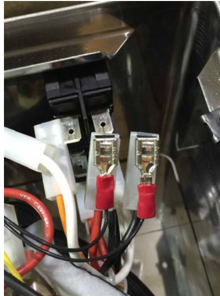
Figure 2. Connect piggyback connectors on black cables to the red and the black cables from the brew switch.

Then put the orange cable back to its original position, which is the top left blade on the brew switch. Also put the white cable back to its original position, which is the top right blade on the brew switch. Please see Figure 4 and Figure 1 for reference.