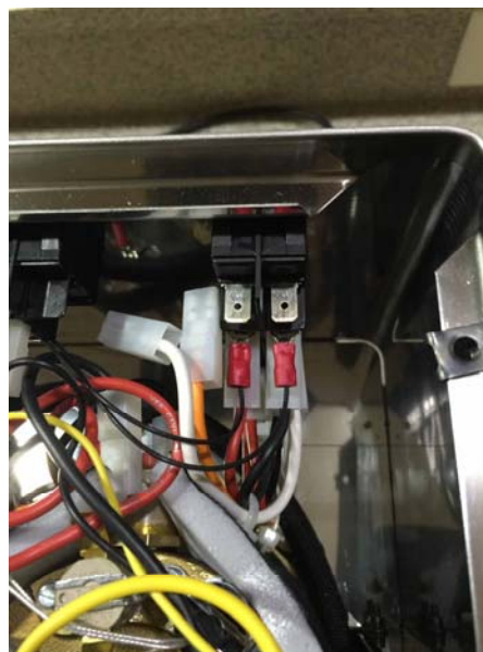
Figure 3. Put the red and the black cable back to the brew switch.