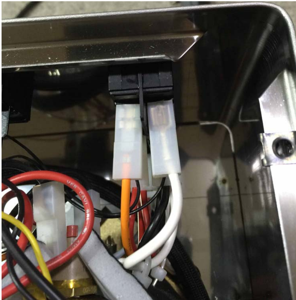
Figure 4. Put the orange cable back to its original position on the brew switch.